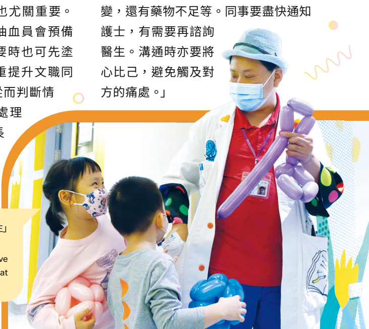
小朋友在診所裏收到「攞笑醫生」的氣球後十分興奮。 Children lit up with joy as they receive balloons from the "Giggle Doctor" at the SOPC.

Inside the SOPC, the Disney Mobile Movie Theatre keeps streaming popular animations and movies. Volunteers from different NGOs also bring joy to children with activities like balloon twisting and handicrafts.