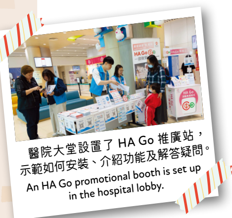
醫院大堂設置了 HA Go 推廣站，示範如何安裝、介紹功能及解答疑問。 An HA Go promotional booth is set up in the hospital lobby.