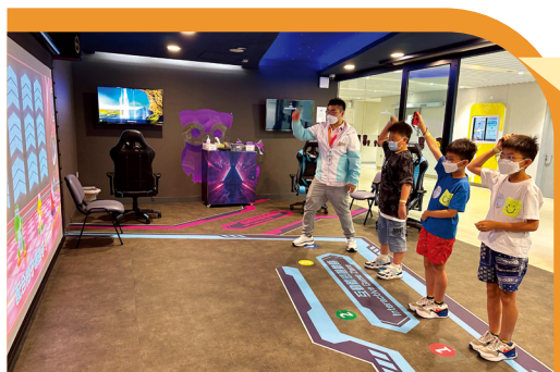
病人資源中心設有虛擬及擴增實境遊戲，讓病童樂在其中。 Young patients having fun with virtual reality and augmented reality games at the Patient Resource Centre.